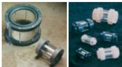
Sight Glasses / Flow Indicators

Water Sight Glass Flow Indicator - Available 1 1/2" to 8" pipe sizes.