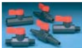
Lab Cock Valve

Astral Spring Check Valves – Injection molded PVC construction with EPDM o-rings.