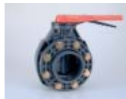
PVC Butterfly Valve