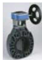
PVC Gear Operated Valve