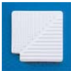
90-Degree Grating Corner

45-Degree Grating Corner – Similar to 90-degree corner, but with a 45-degree bend.