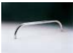
Exercise / Therapy Rail

Recessed Wall Step – Fabricated of 14 gauge 304 stainless steel with an all welded design. 17" x 5" opening with a slip resistant finish for added safety.