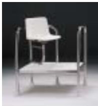
Short Lifeguard Chair

Mid-Height Lifeguard Chair - Constructed of 1.7" OD stainless steel tube. Seat is 5' above the pool deck. This lifeguard chair offers a taller height for excellent visibility.