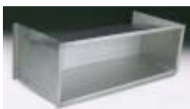
Recessed Wall Step

Anchor Set – Set includes 2-1.9" wedge style bronze anchors spaced 20" apart on a stainless steel spacer bar for new construction. Bronze anchors also sold separately.