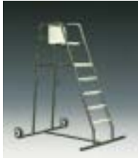
Portable Lifeguard Chair

Short Chair - Constructed of 1.7" OD stainless steel tube. Seat is 3' above the pool deck. Chair offers a safer alternative to the taller lifeguard chairs.