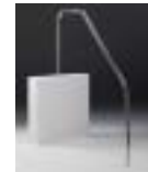
3-bend Hand Rail

Cross Braced Deck Mounted Stair Rail – Cross-Braced deck mounted rails are constructed of a 1.9" OD 304 grade of stainless steel with a polished and buffed finish. Custom models available.