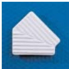
45-Degree Grating Corner