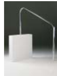
2-bend Hand Rail

3-Bend Stainless Steel Hand Rails – 3-Bend stair rails are constructed of a 1.9" OD 304 grade of stainless steel with a polished and buffed finish. Custom models available. Anchors and escutcheons are sold separately.