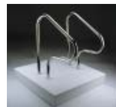
Figure 4 rails