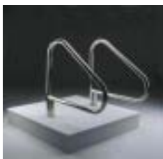
Adjustable Fig. 4

Wall Mounted Hand Rails – Exercise / Therapy Rails – Figure 4 grab rails are constructed of a 1.9" OD 304 grade of stainless steel with a polished and buffed finish. Includes mounting plates and escutcheons.