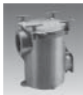
3 & 5 Cast Iron Pump Strainers

Astral 7.5, 10, 15, and 20 HP Cast Iron Pumps – Specially designed for large commercial swimming pools, spas, or water parks where high performance and self-priming characteristics are necessary.