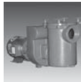
7.5 - 20 HP Pump

Astral Cast Iron Strainers – 7.5, 10, 15 & 20 HP – Rugged cast iron construction. Separate bolt-on cast body and cover; Stainless Steel toggle bolts, ductile iron wing nuts. Stainless Steel basket.