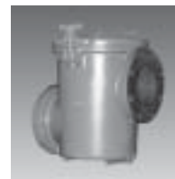
7- 20 HP Strainer

Astral 25, 30, 40, and 50 HP Cast Iron Pumps – Specially designed for large commercial applications where high performance and self-priming characteristics are necessary.