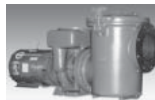
25-50 HP pump

Polyester Strainer for all models – Constructed of fiberglass reinforced polyester with PVC flanges, stainless steel hair and lint basket. Features drain port for easy winterizing.