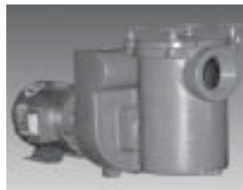
Astral Self-Priming Pump

3 & 5 HP Cast Iron Pump Strainers – Heavy cast iron construction. Separate bolt-on cast body and cover; threaded locking handles. Stainless steel basket.