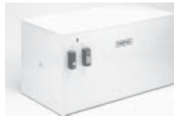
Electric Pool Heater

Pool heaters in 208V, 240V and 480V 3 Phase also available upon request. All heaters have stainless tank with built in flow switch.