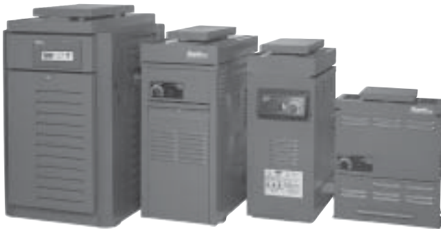
Raypak 2100, 155, 105, and 55 BTU Heaters

By Raypak – Raypak offers a pool heater that is the most efficient (with up to 82% thermal efficiency), and offers one-of-a-kind engineering and manufacturing innovations. The Raypak commercial pool heater is unrivaled for heating efficiency, operating economy, low-cost installation, and all-around dependability. Heaters are fully tested at the factory to ensure on-site performance. Call toll-free for further information, ordering information, and pricing.