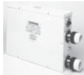
Electric Pool and Spa Heater